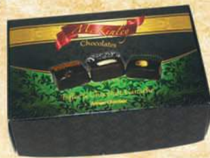
Ganache & Toffee Boxes R78.00 R114.00 (12 per box)