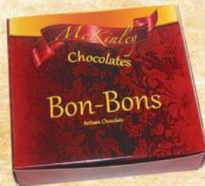
Bon Bons Boxed R82.00 R114.00 (16 per box)