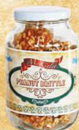
Peanut Brittle R175.00 (12 units)