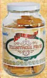
Fudge R210.00 (72 units)