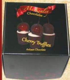
Cherry Truffles Boxed R84.00 R120.00 (9 per box)