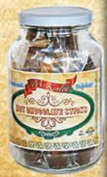
Hot Choc Sticks R230.00 (20 units)