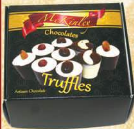
Truffles Boxed R71.00 R102.00 (9 per box)