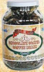
Coated Coffee Beans R350 (24 units)