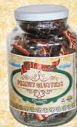
Peanut Clusters R265.00 (36 units)