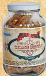
Sesame Brittle R175.00 (12 units)