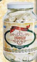
Nougat R310.00 (48 units)