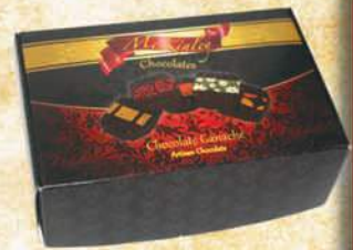
Ganache Chocolate Boxed R78.00 R114.00 (12 per box)