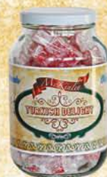
Turkish Delight R320.00 (24 units)