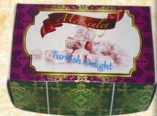
Turkish Delight Boxed R40.00 R58.00 (12 per box)