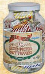
Mixed Coated Toffee R610.00 (36 units)