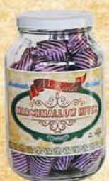
Marshmallow Hives R430.00 (40 units)