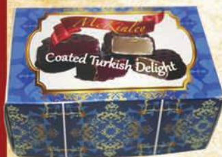
Turkish Delight Coated Boxed R52.00 R72.00 (12 per box)