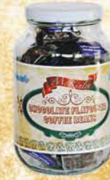
Uncoated Coffee Beans R350.00 (24 units)