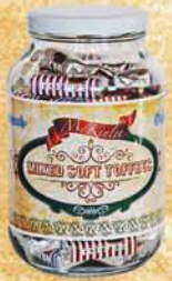
Mixed Toffee Uncoated R530 (48 units)